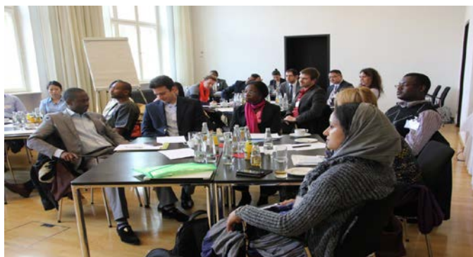
Young Physician Leaders Workshop Session 2013

The launch of the InterAcademy Partnership as an integrated global network is the next step in harnessing the power of science to address global challenges. Global challenges require global solutions, and successful