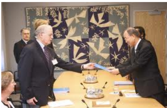
Delivering the IPCC review report to the UN Secretary General 2010