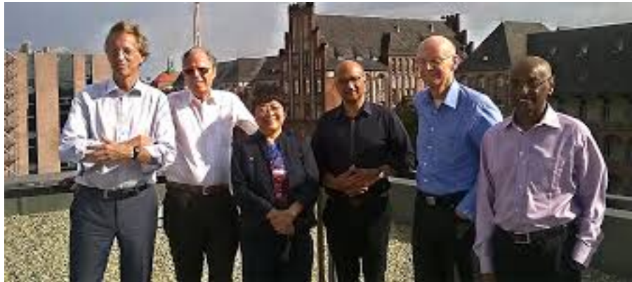
InterAcademy Partnership Steering Committee, Berlin, 2014

Academies represent the scientific, medical and engineering leadership of individual countries and of the entire world. They are typically independent, self-perpetuating national institutions that recognize excellence and achievement. Academies are merit-based, with members selected from among the leading scientific, medical and engineering minds within a country. IAP is able to harness the power and authority of these academies and access their combined scientific talent.